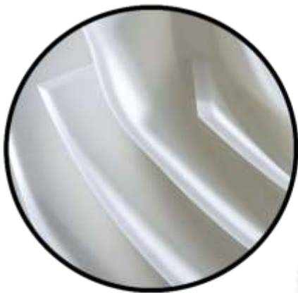
Close up a printed object with PLA-X 3 (Printed on an Ultimaker 2+, 0.19 layer height, 242c)

Specimens are printed at 50mm/s, 0.2 layer height, 0.4 nozzle, 100% infill and annealed in a pre-heated oven at 110c for 1 hour. After annealing the oven is allowed to slowly cool completely off for the best crystallization results.