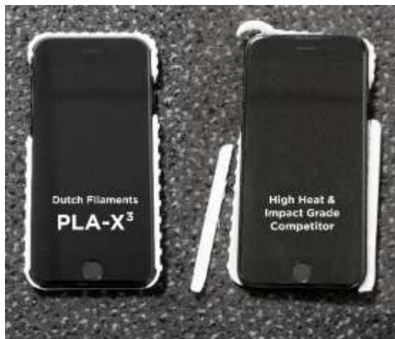
3D printed iPhone 7 cases (after annealing at 110°C / 20min)

PLA-X 3 still fits where the competitor had so much shrinkage that the part has become useless because it simply became too small.