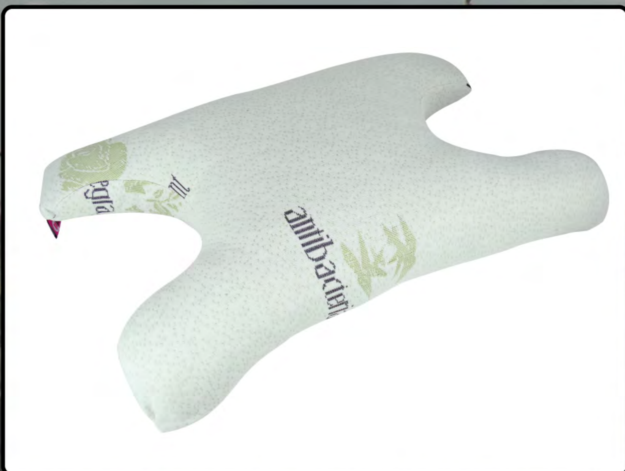
CPAP Nasal pillow Ref: 116125