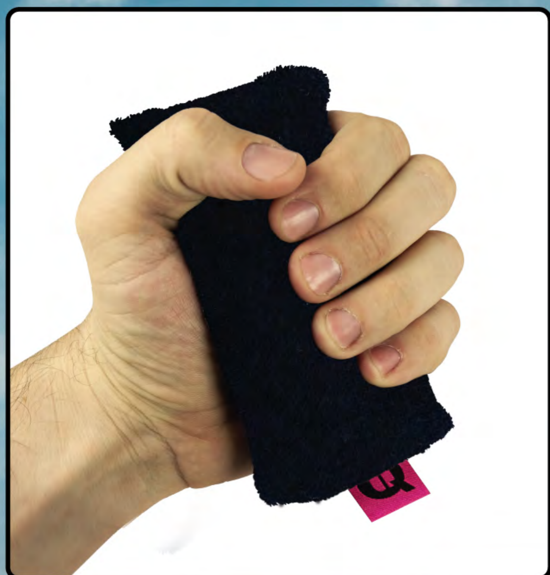
Hand cushion Ref: 804016