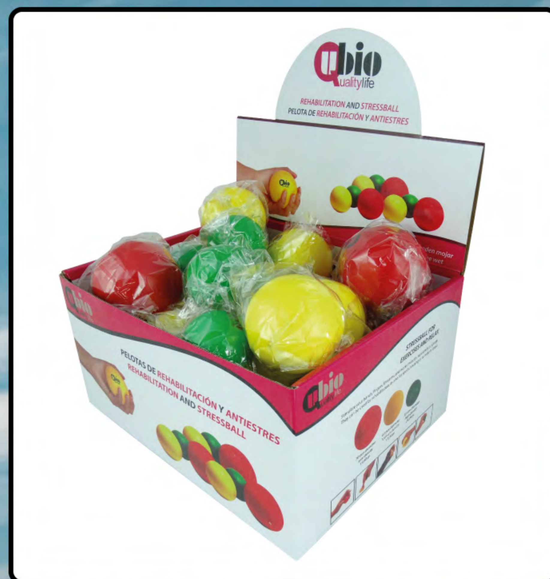
Hand therapy balls box Ref: 804000