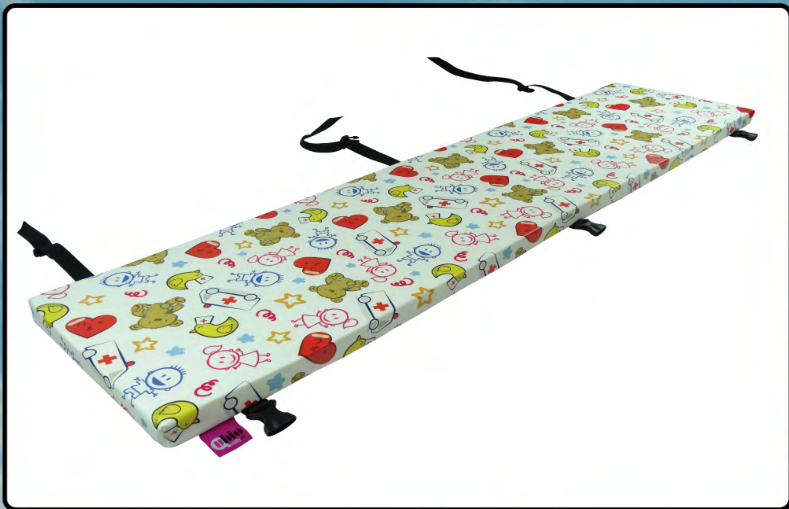
Siderail protector children Ref: 703150 - 140x35 cm