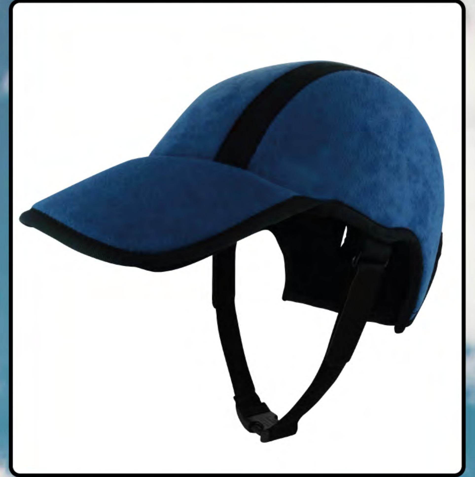
Blue peaked cap protector Ref: 702034