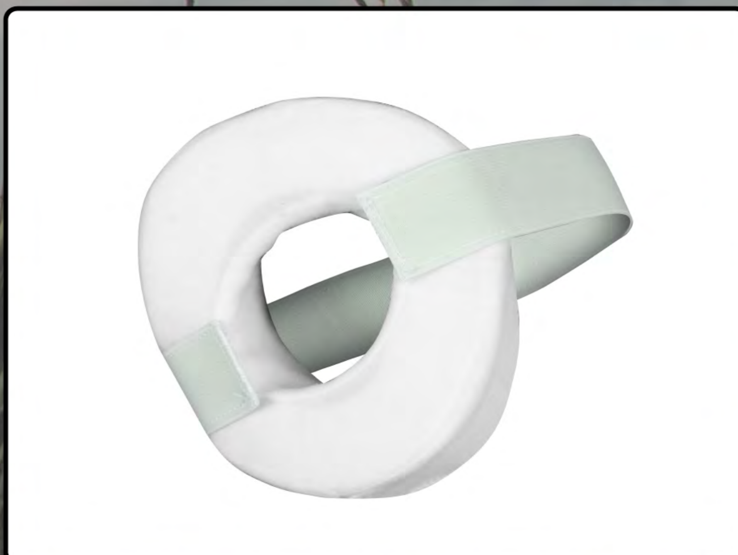
Postoperative ear protector Ref: 106175