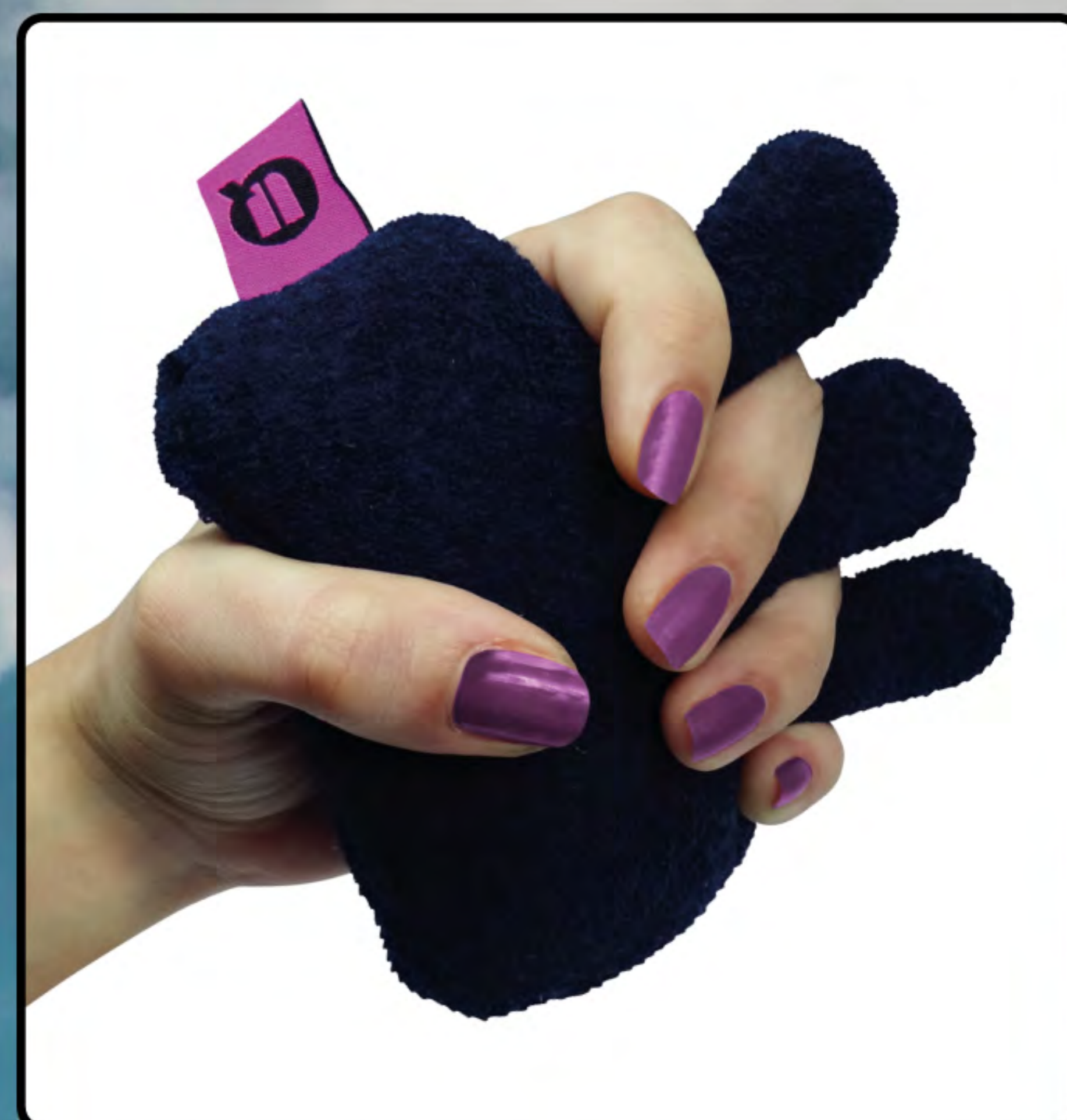
Finger contracture cushion Ref: 804014