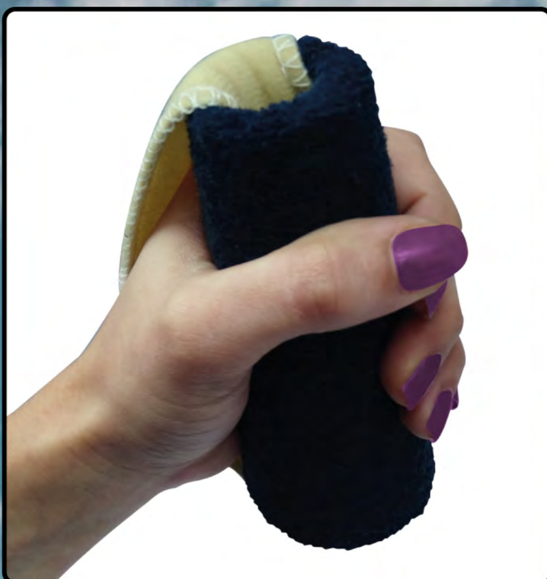
Hand cone Ref: 804012