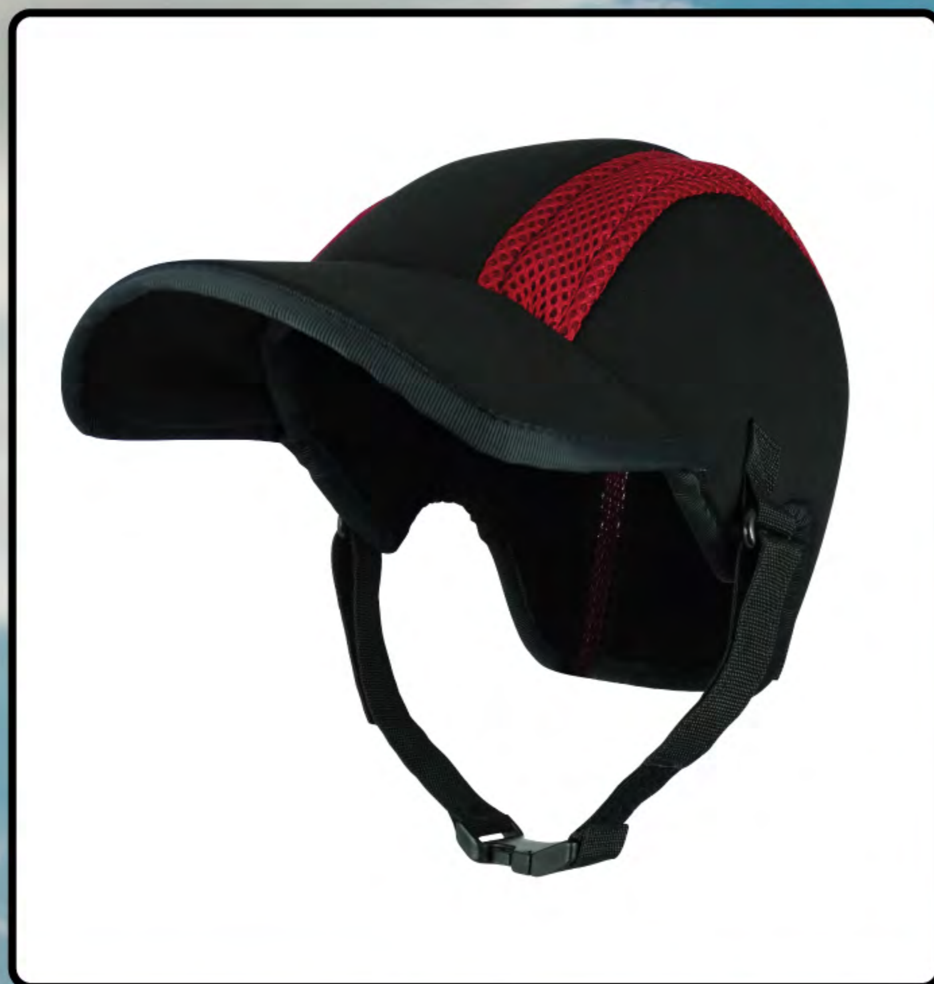
Brathable peaked cap Ref: 702036