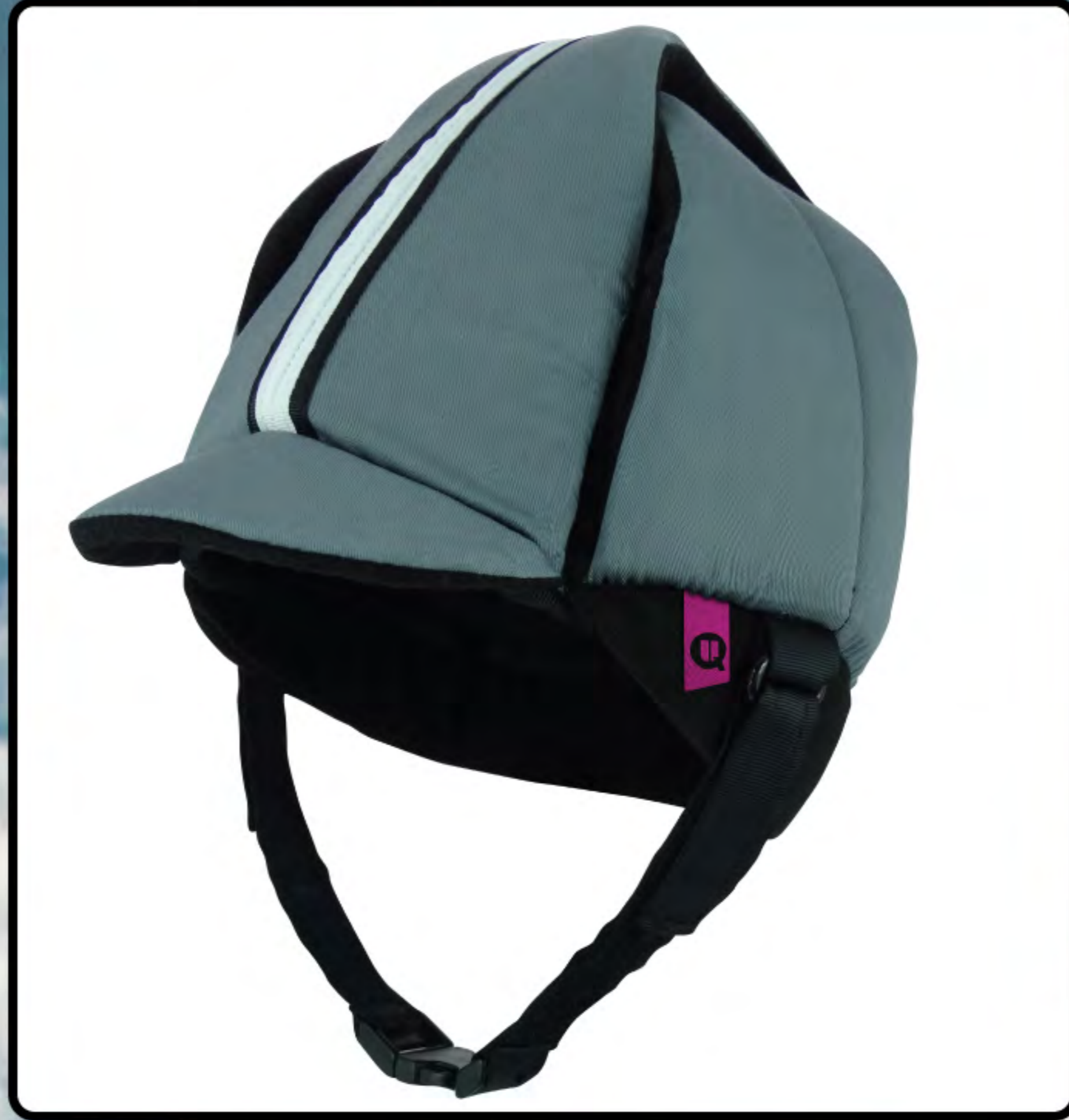
Breathable peaked cap Ref: 702032