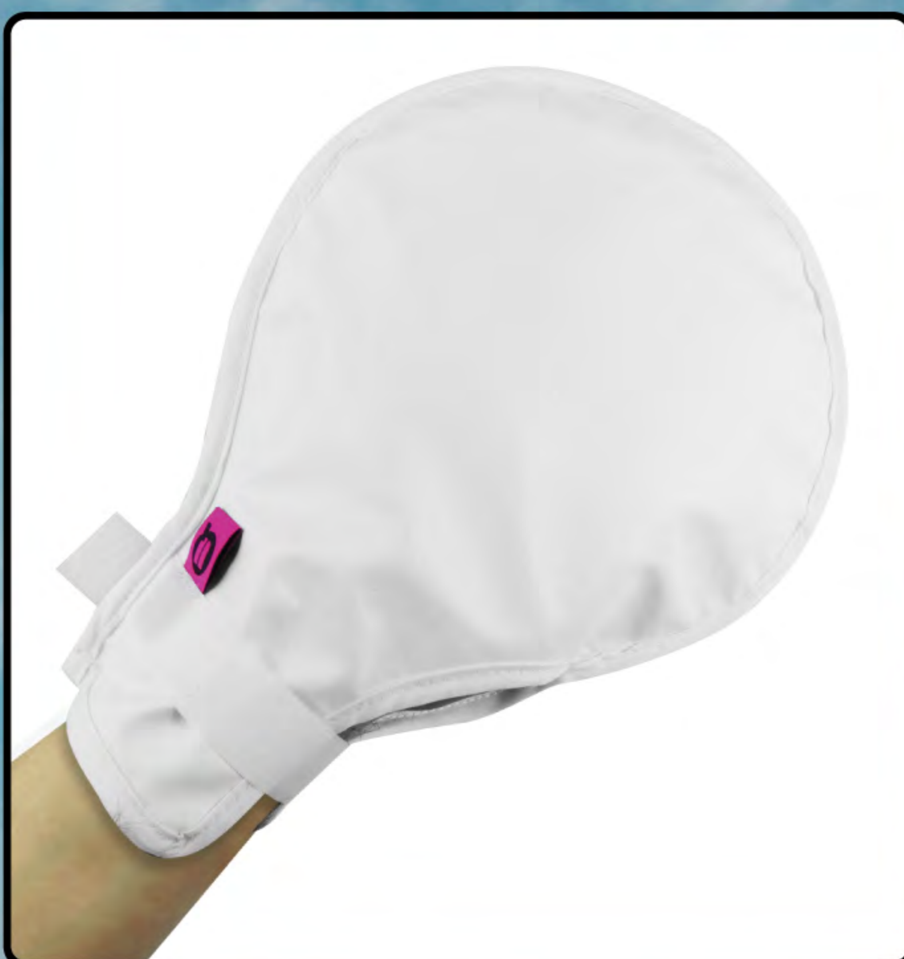
Microbeans mitt Ref: 804020