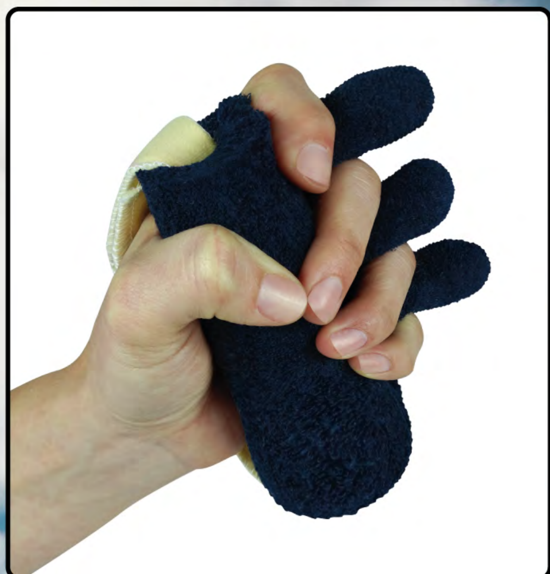
Hand cone finger separator Ref: 804010