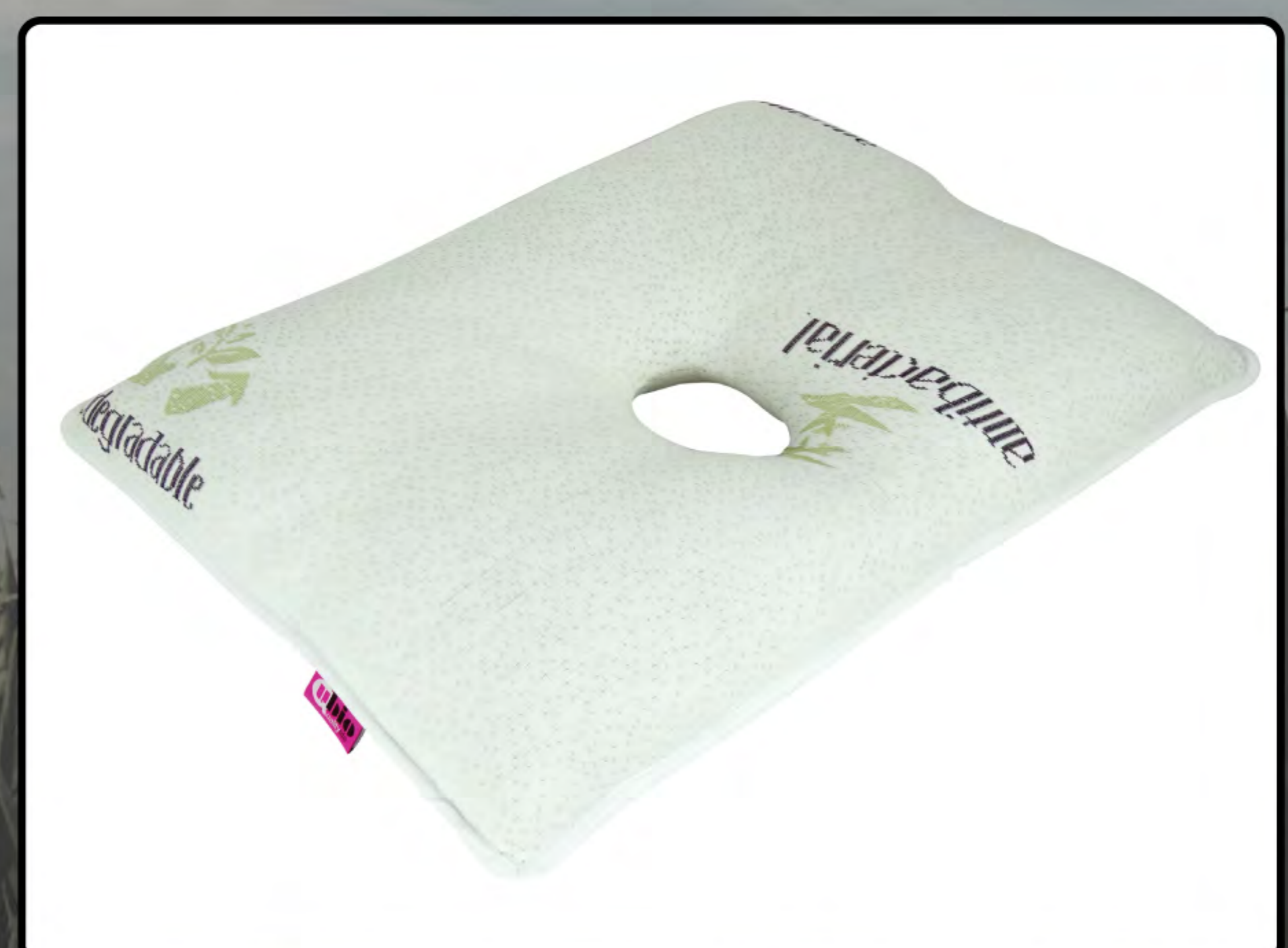
Chondrodermatite pillow Ref: 116100