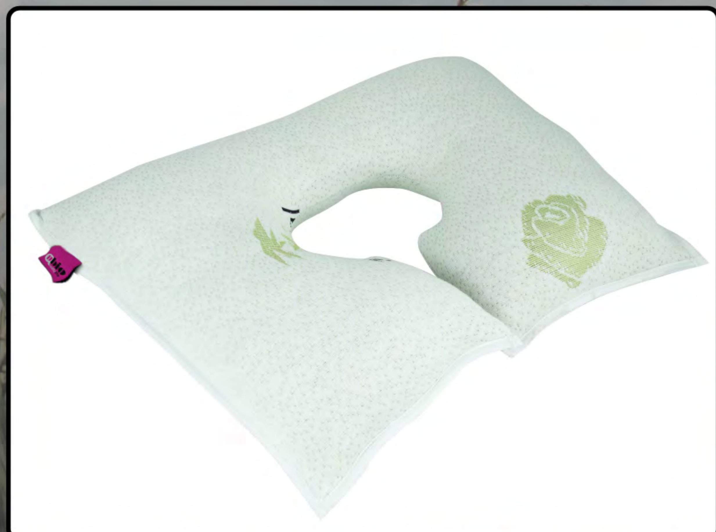
Postoperative ocular pillow Ref: 116150