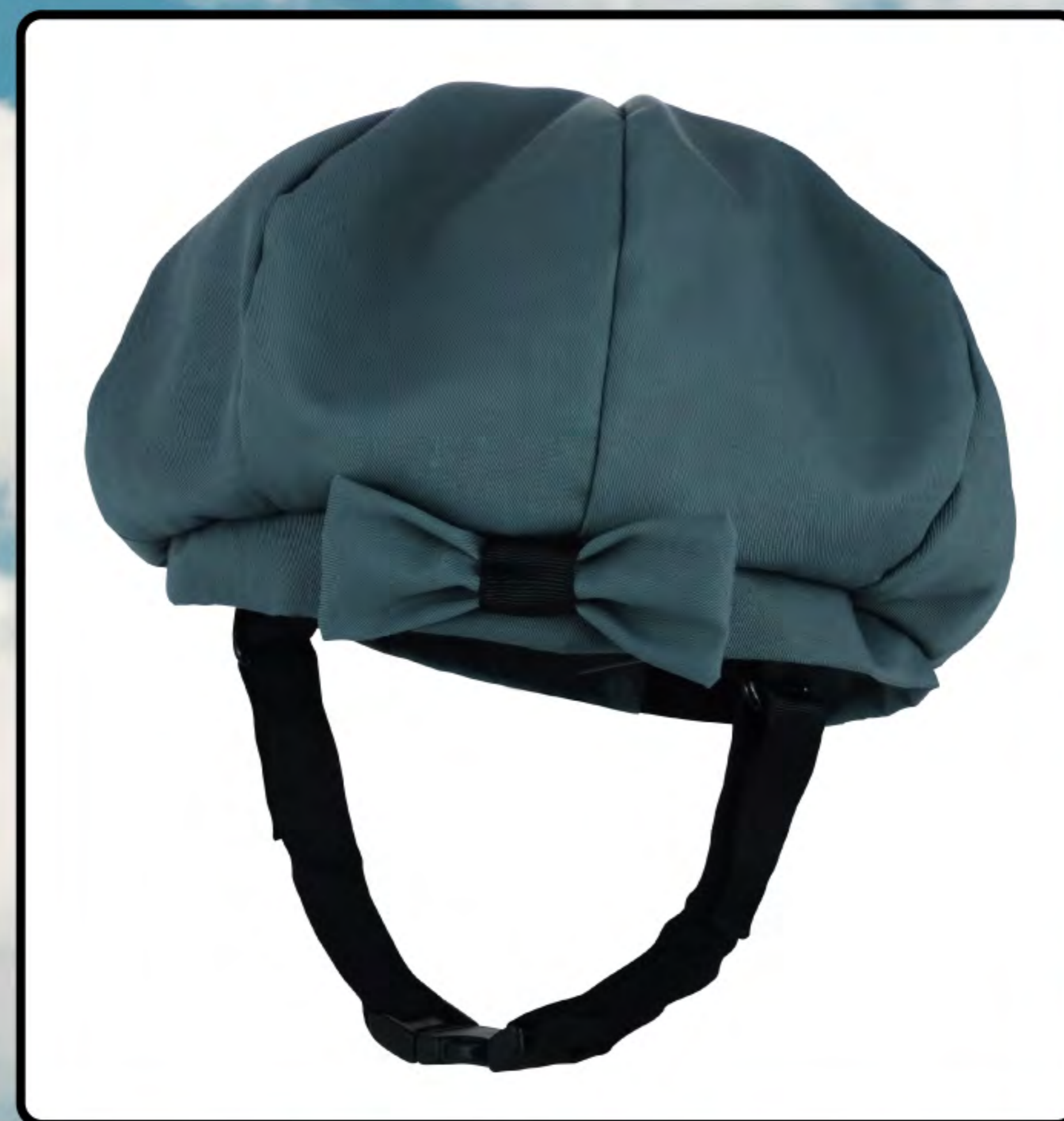
Peaked cap for women Ref: 702038