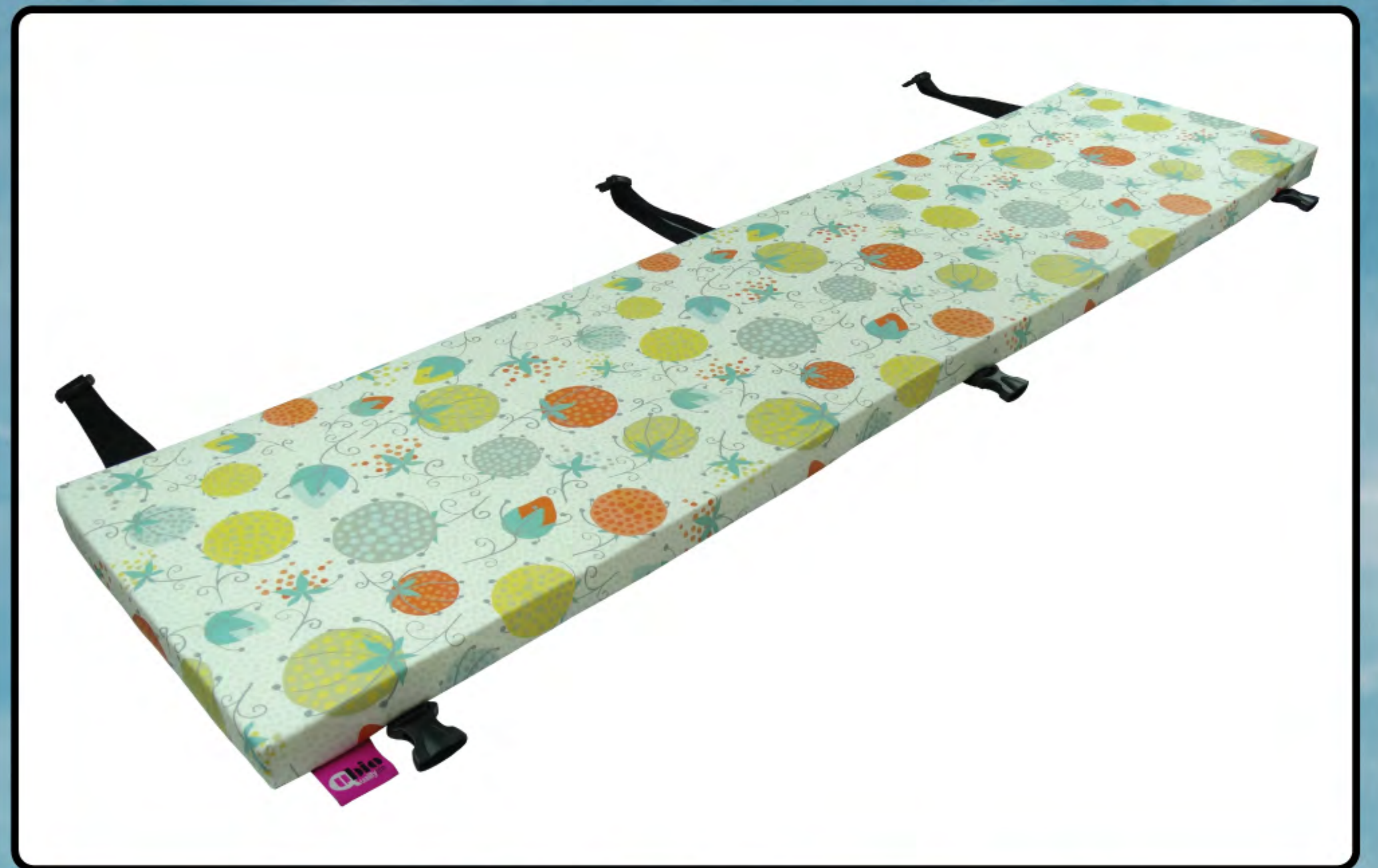
Siderail protector fruits Ref: 703155 - 140x35 cm