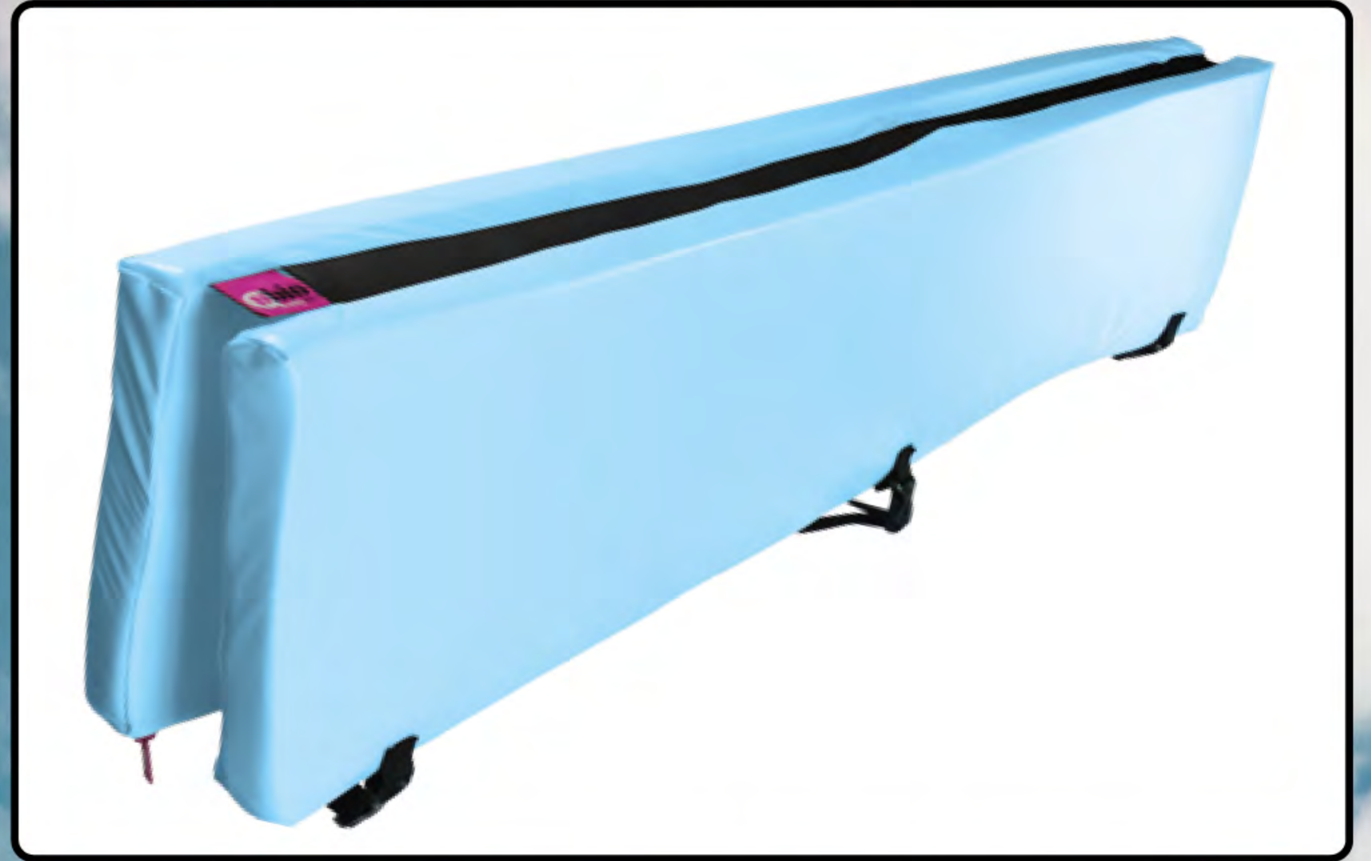
Barandex double-side rail protector Ref: 703110 - 140x35x3,5 cm