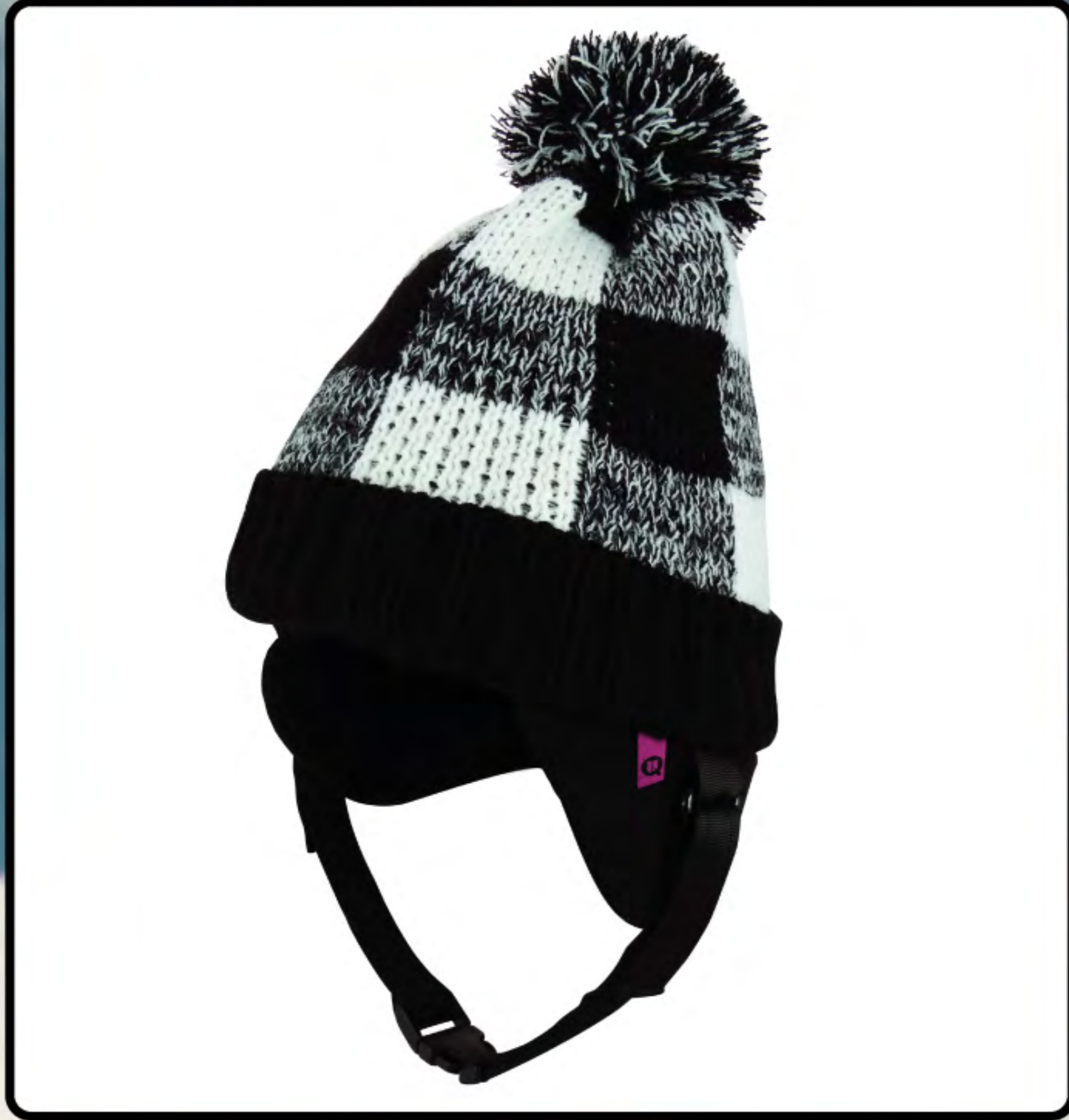
Beanie cap Ref: 702030